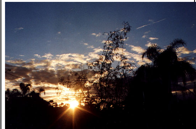
God's creation at its best